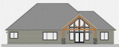
REAR ELEVATION SHOWN IN TIMBER