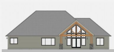
REAR ELEVATION SHOWN IN TIMBER