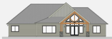
REAR ELEVATION SHOWN IN TIMBER