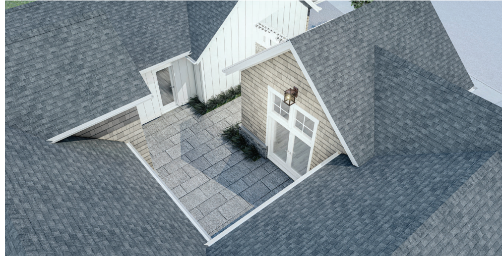
COURTYARD RENDERING - BEDROOM DOOR