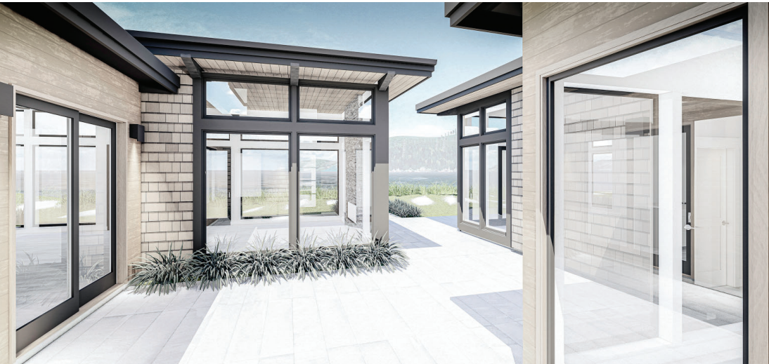
COURTYARD LOOKING TO BEACH