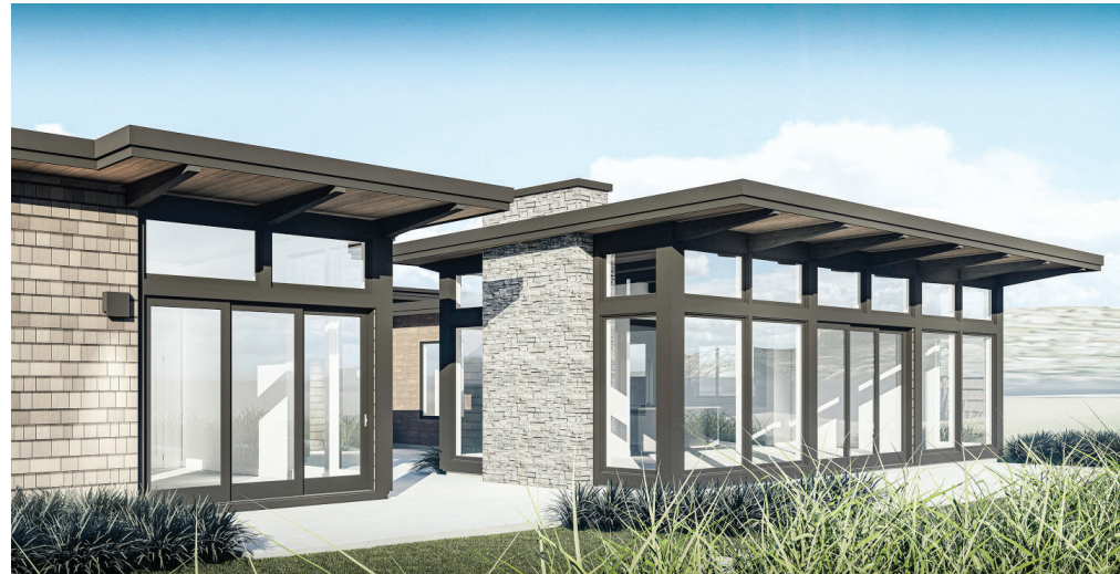
BEACHSIDE ISO CLOSE-UP