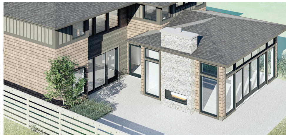
BEACHSIDE PATIO SPACE