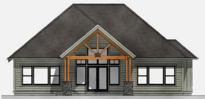
REAR ELEVATION SHOWN IN TIMBER FRAME